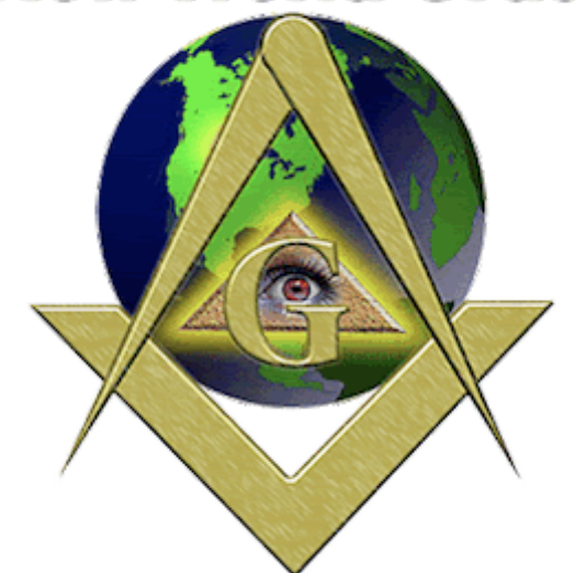
Pages » Contact